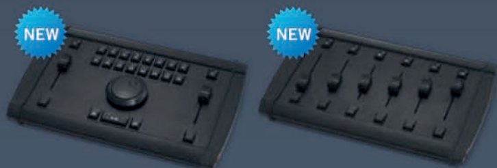
Jog Shuttle Controller and Fader Board

For intuitive live editing Pandoras Box Manager ships with an external Jog Shuttle Controller (STD & PRO versions) and an additional Fader Board to control up to 8 timelines simultaneously (PRO version only). A 19" Workstation is available upon request.