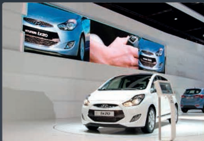
Hyundai product presentation at Salon Mondial 2010